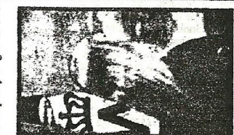
Judging from the image from the "Creators' Web site, even recruits can have albino, shiny hair.

As expected, local members of the racist Creativity Movement have plenty of gall when it comes to dispersing segregationist literature, but turn out to be cowardly when it comes to showing their faces. Last week Sunday invited members of the white supremacist "religion" to schedule an interview with our residents who received the group's recent hateful mass mailing can put names and faces with the 32-page booklets.